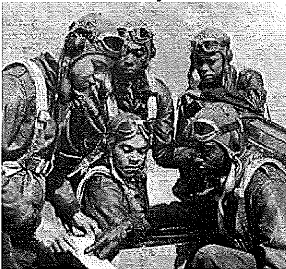
Tuskegee Airmen, WWII